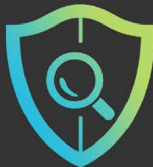
DETECTION & RESPONSE